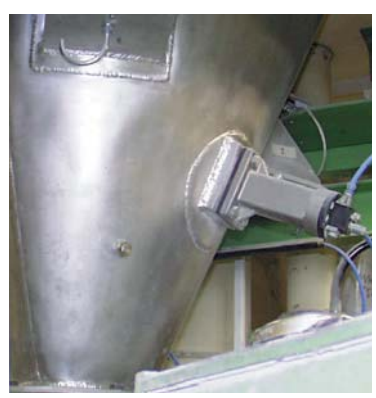
Cleaning bunker walls