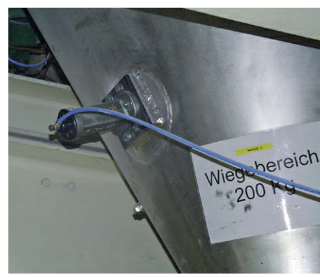
Cleaning weighing containers